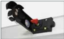
Release system protected by metal lock with release key at the inside.

* Duty Cycles depend on gate size and installation