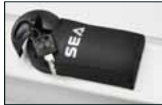
Release with metal lock protection