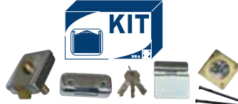
16700060 LOCK KIT 12V Electric lock Counter-plate for horizontal or vertical mounting external and internal cylinder