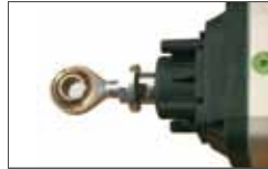
Round joint bearing for stroke adjustment